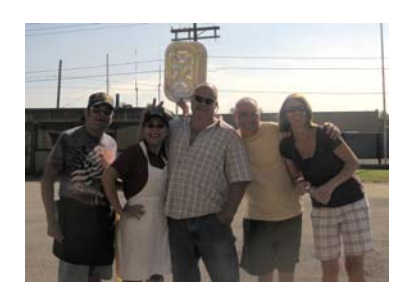
Let the day begin!