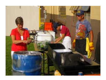
Once properly trained he did potatoes pretty good! (above)