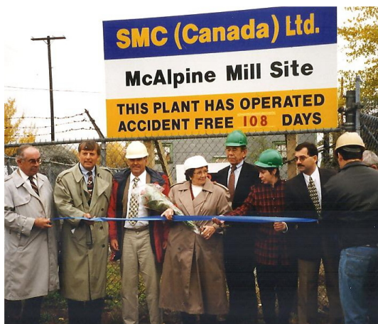
1998 - McAlpine Mill Dedication