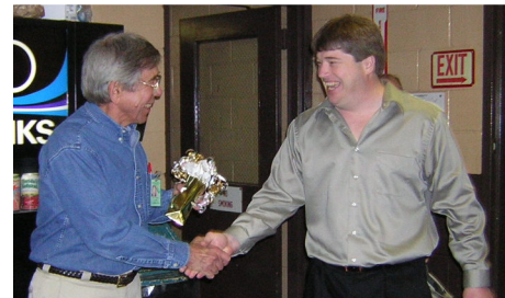
2015 – Scottsville Retirement Party