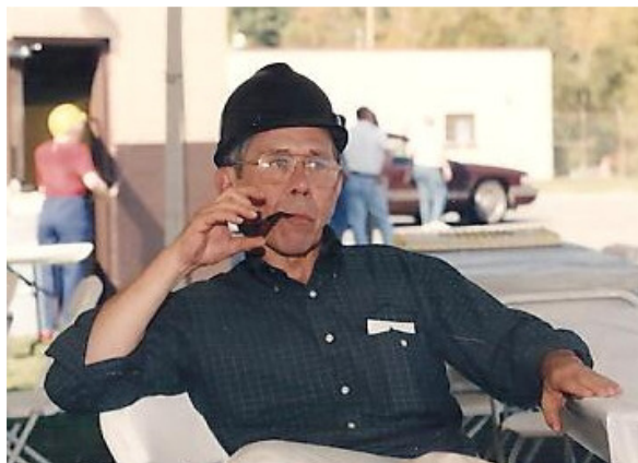
1995 – Sabin 50 th Anniversary Picnic