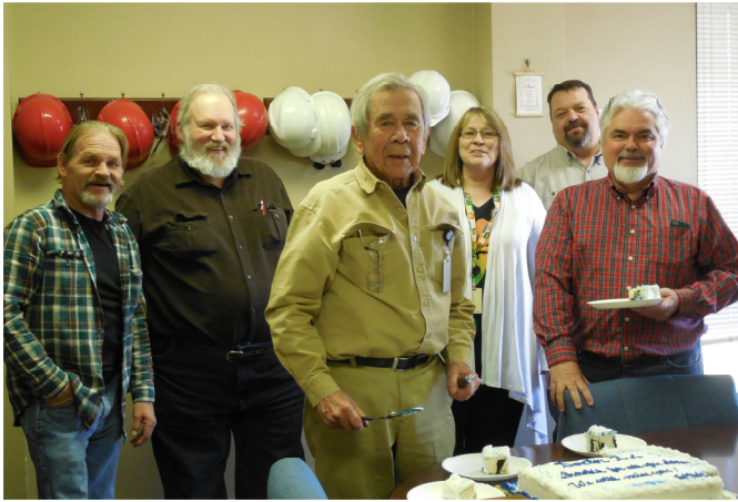
2015 – Williston, ND Retirement Party