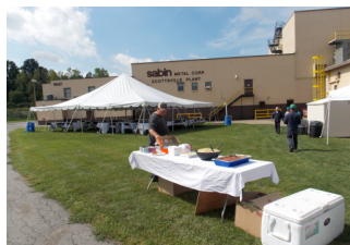
(Above Right) Pre-celebration set up on another fine day.