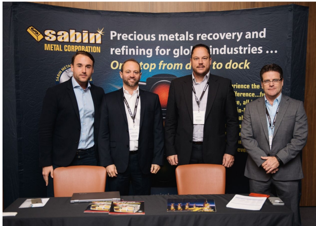
Hard at work at the ERTC Conference in Lisbon.