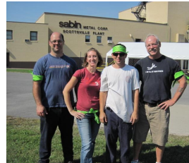
Team AG BULLETS