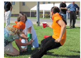
Drinking & Walking??