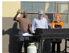
The Food Testers