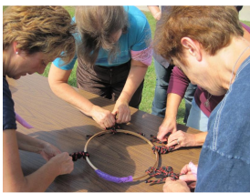
Knot so Bad