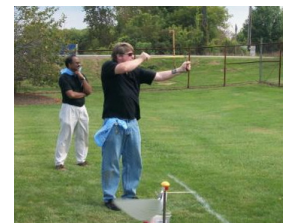
Man Card – INTACT