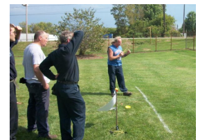
Team SWEET SPOT