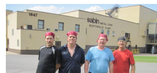
2012 Gold Metalist Team CHEMICAL WARRIORS