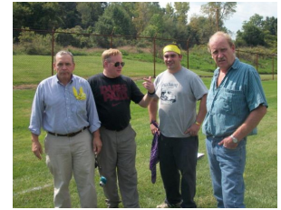
Team PURPLE P's