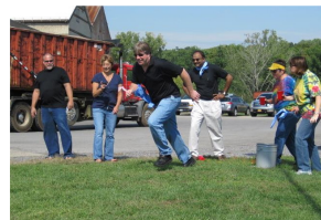
Dessert is ready!