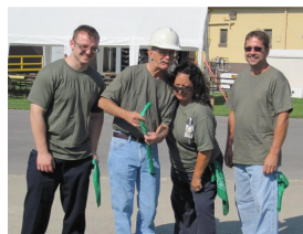
Team MEAN & GREEN