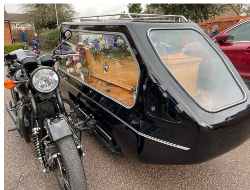
Alan's final ride!